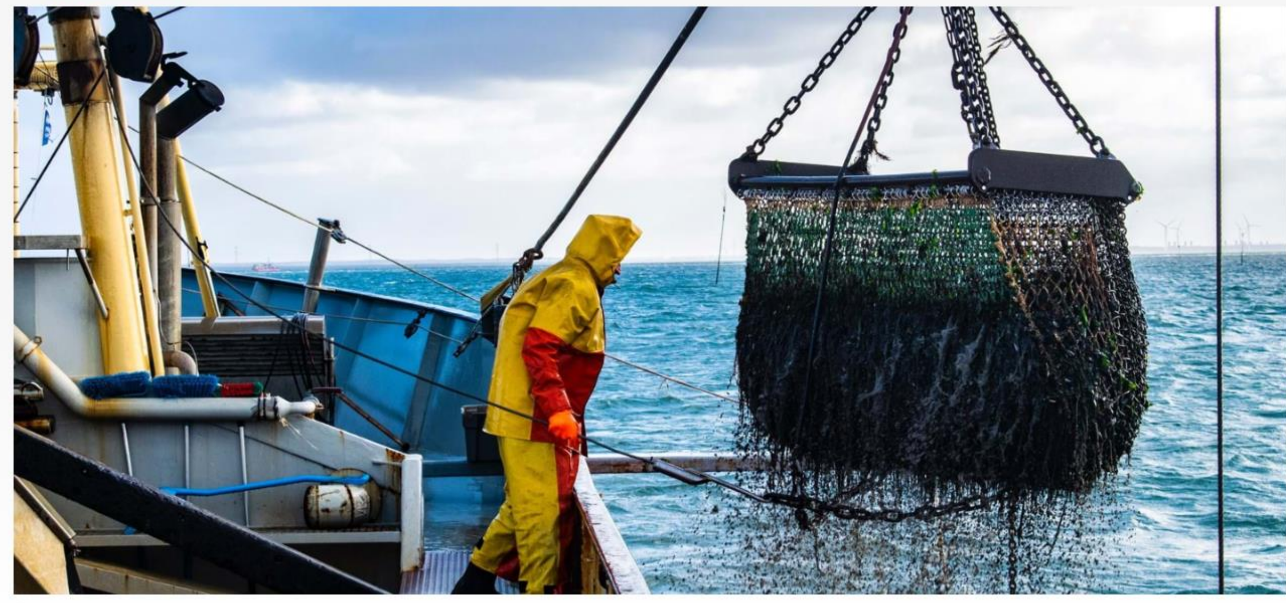
O Dutch beam trawler.

By Undercurrent News | Sept. 19, 2023 09:13 BST